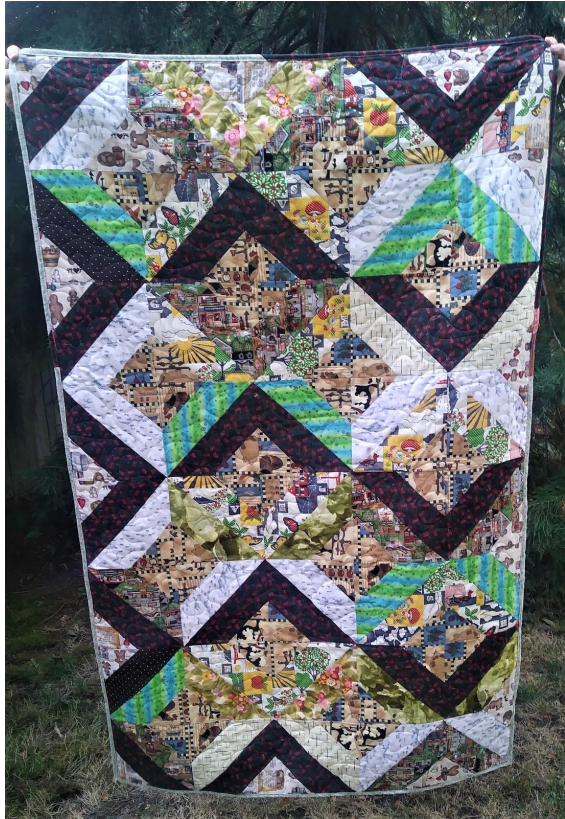
the novelty print was Americana