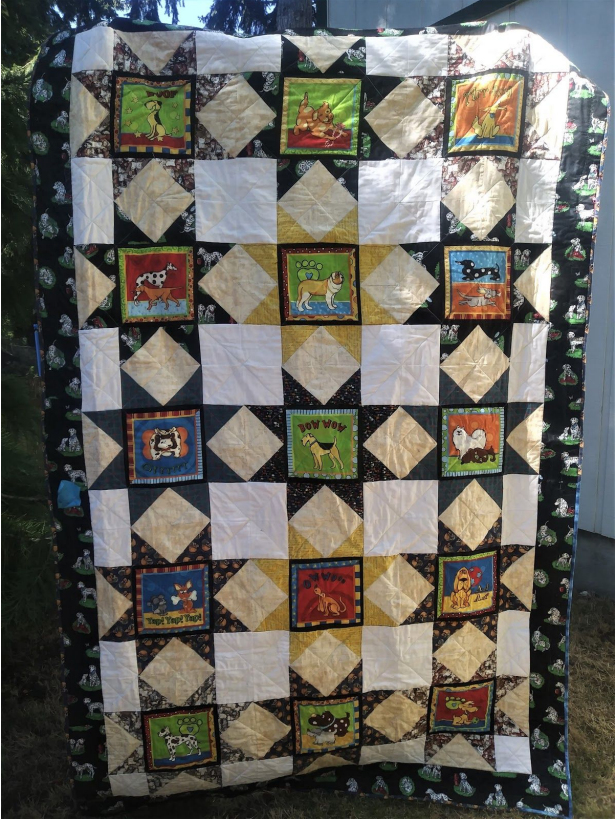
the novelty print had a bunch of dogs