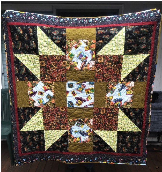
Rte 66 (the center square) is novelty