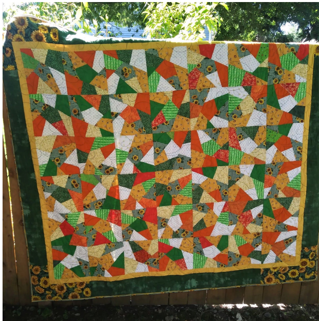
Sunflowers were the novelty & in every block