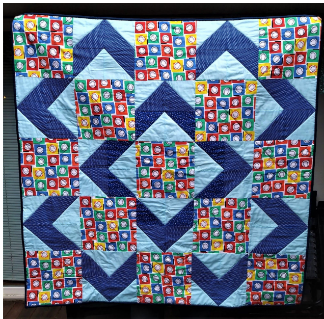
Baseball is the novelty here