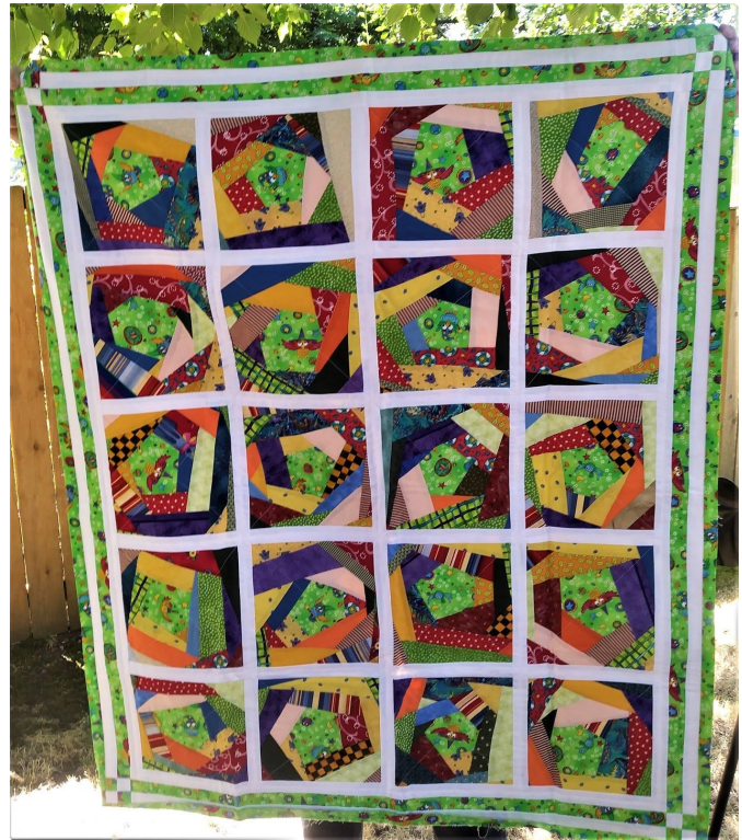
there are crazy birds (novelty) in the center