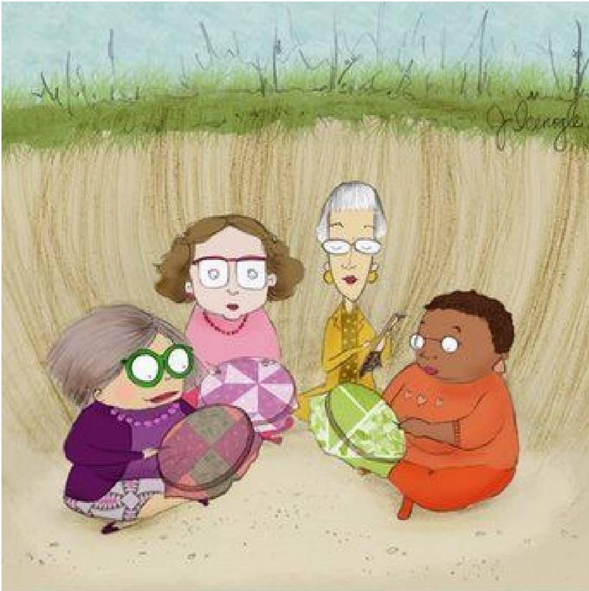
Stich in the Ditch Club

Sea Pal Quilters Whale of a Quilt Show , "It is with great regret to announce there is NO quilt show in 2023 or 2024. Thank you to all our supporters and attendees."