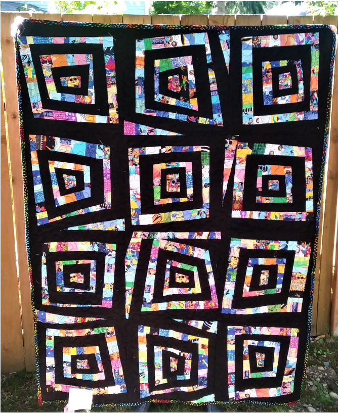
the center piece (and in the squares)